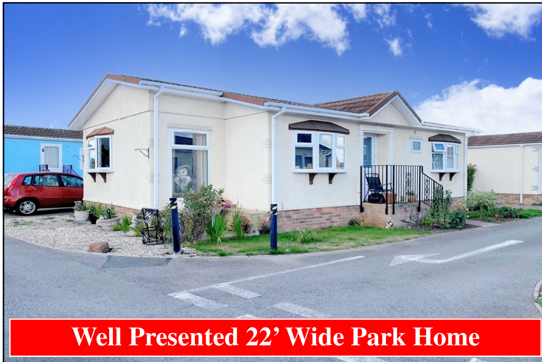
Well Presented 22' Wide Park Home

65 Selwood Park, Weymans Avenue, Kinson, Bournemouth. BH10 7JU