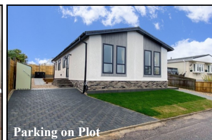
Parking on Plot