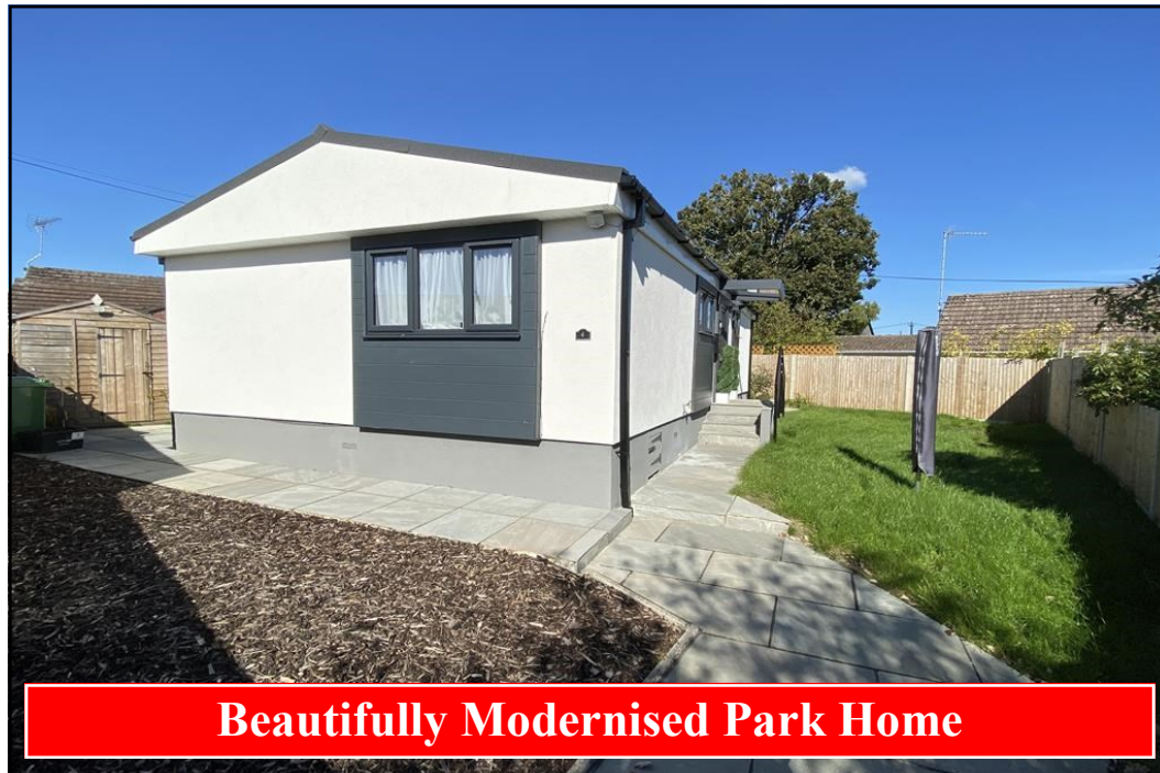
Beautifully Modernised Park Home

4 Lumby Park, Lumby Drive, Poulner, Ringwood. BH24 1JL