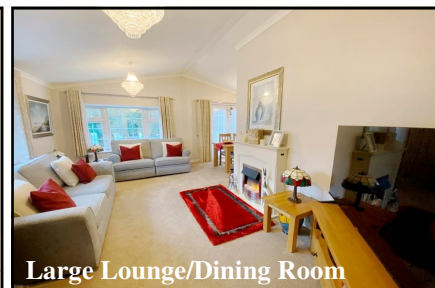
Large Lounge/Dining Room