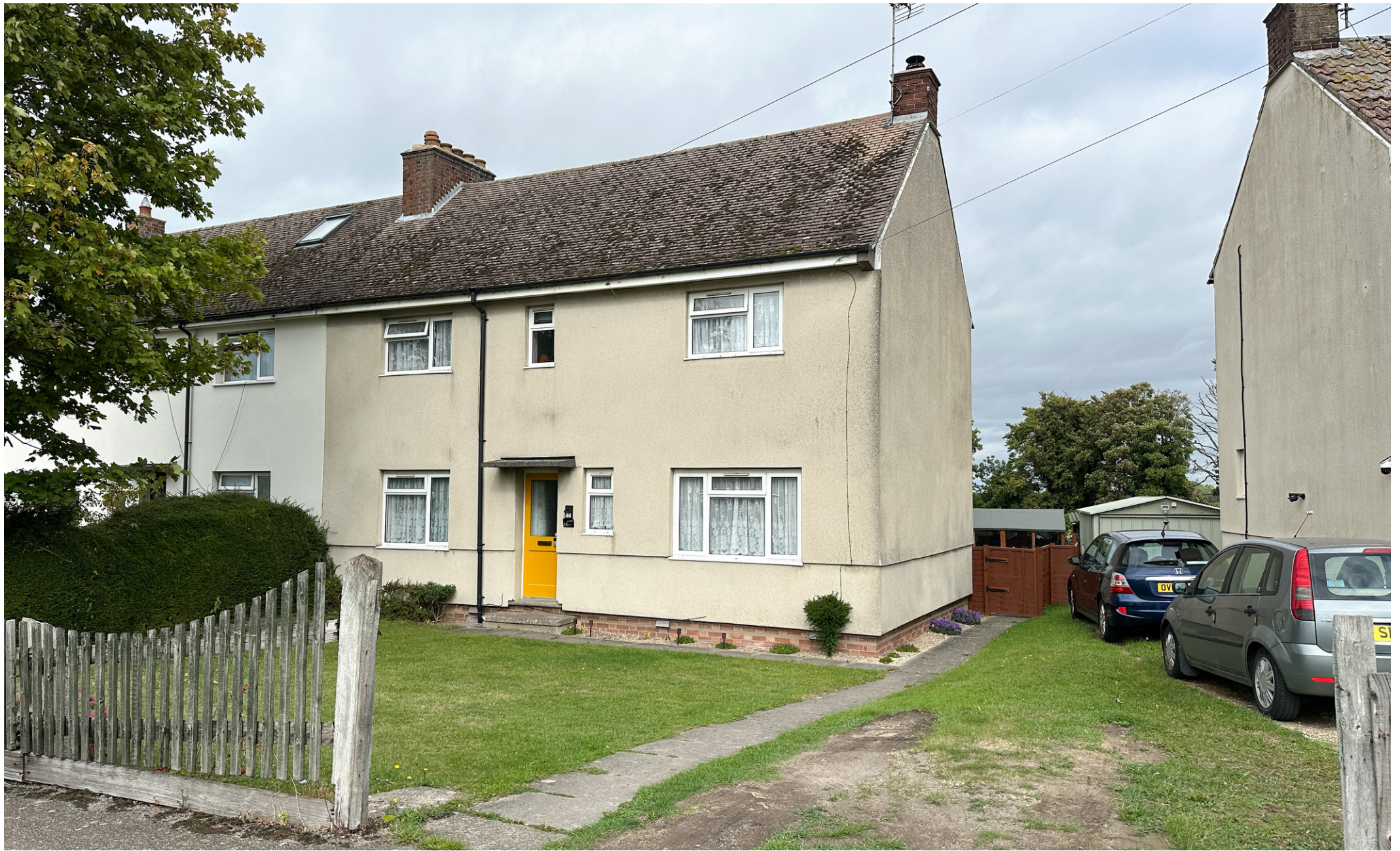
Fairview Grove, Swaffham Prior.