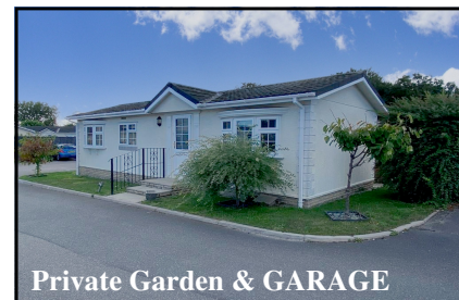
Private Garden & GARAGE