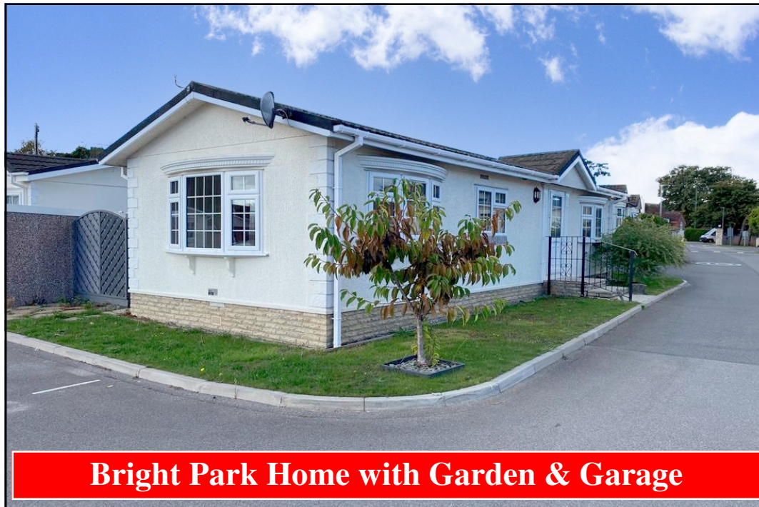
Bright Park Home with Garden & Garage

74 Stour Park, New Road, Bournemouth, Dorset. BH10 7DE