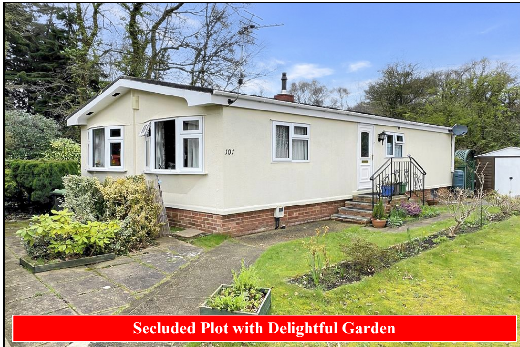
Secluded Plot with Delightful Garden

101 Gladlands Park, Ferndown, Dorset. BH22 9DQ