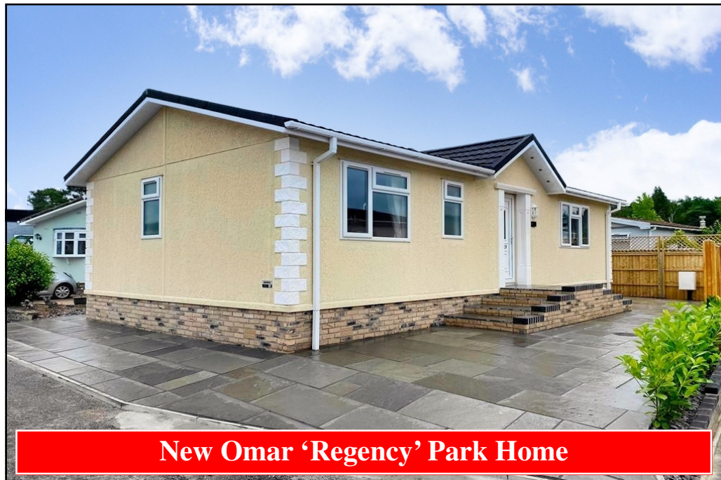
New Omar 'Regency' Park Home

41 Pinehurst Park, West Moors, Ferndown, Dorset. BH22 0BW