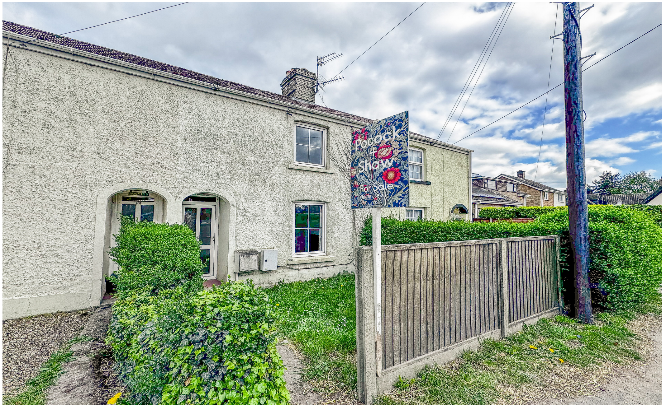
Isleham Road, Fordham, Cambridgeshire