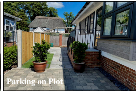
Parking on Plot