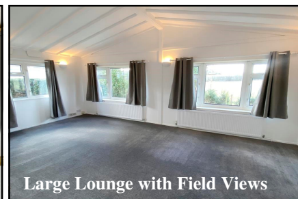
Large Lounge with Field Views