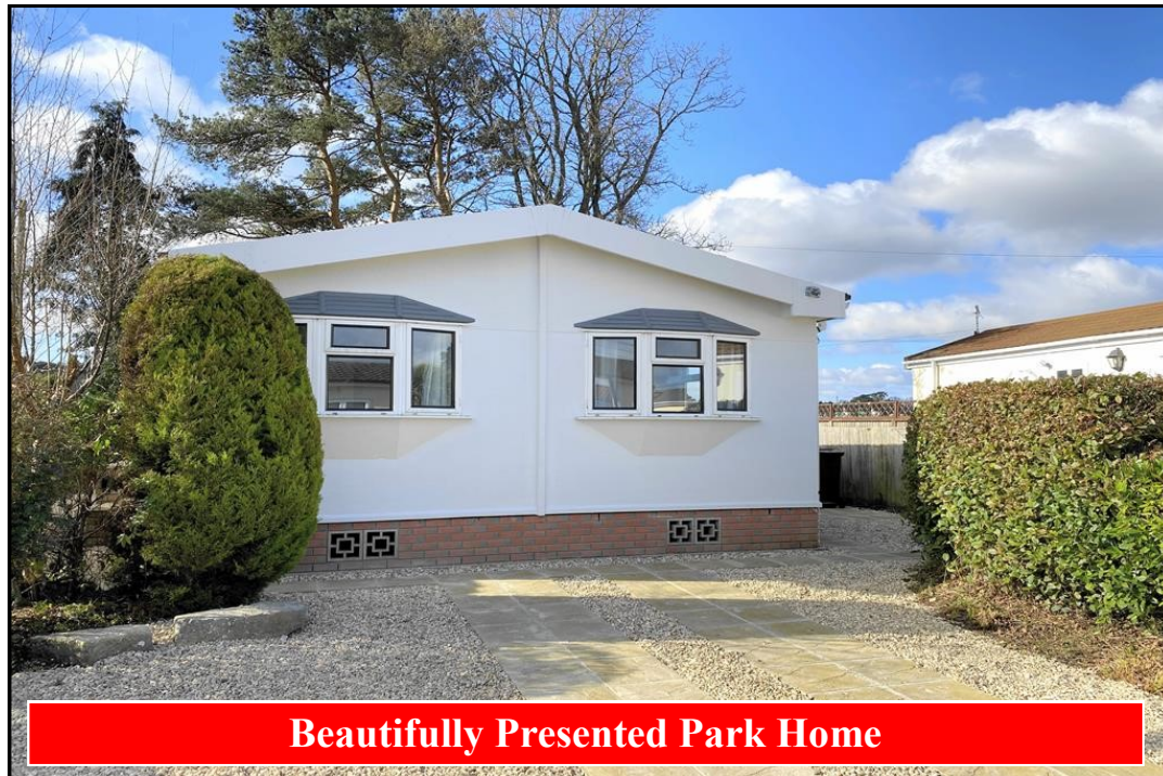
Beautifully Presented Park Home

12a Holton Heath Park, Wareham Road, Holton Heath, Poole. BH16 6JS