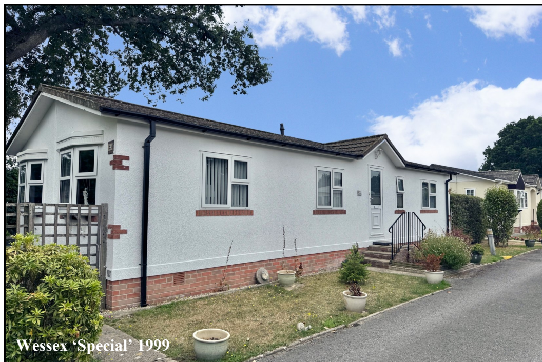
Wessex 'Special' 1999

23 St Leonards Farm Park, Ringwood Road, West Moors, Dorset. BH22 0AG