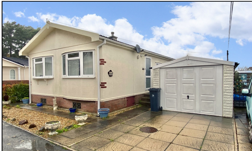
Well Presented & Spacious Park Home

46 Holton Heath Park, Wareham Road, Holton Heath, Poole. BH16 6JS